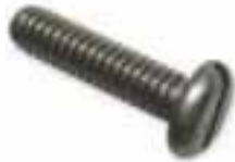
METRIC SLOTTED PAN HEAD MACHINE SCREWS