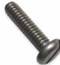
SLOTTED PAN HEAD MACHINE SCREWS SS