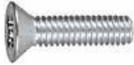
PHILLIPS FLAT HEAD MACHINE SCREWS