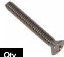
PHILLIPS OVAL HEAD MACHINE SCREWS SS