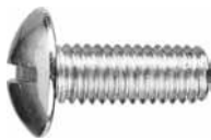
SLOTTED TRUSS HEAD MACHINE SCREWS