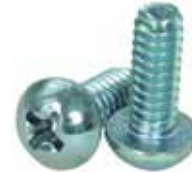
PHILLIPS ROUND HEAD MACHINE SCREWS