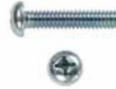
PHILLIPS ROUND HEAD MACHINE SCREWS