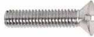
SLOTTED FLAT HEAD MACHINE SCREWS