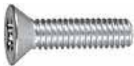
PHILLIPS FLAT HEAD MACHINE SCREWS