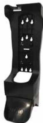
IBS No. 75006D Dispenser