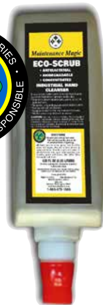
IBS No. 75006 120 oz