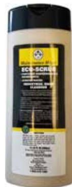
IBS No. 75007 13.5 oz