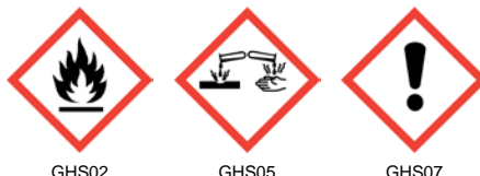
GHS02 GHS05 GHS07